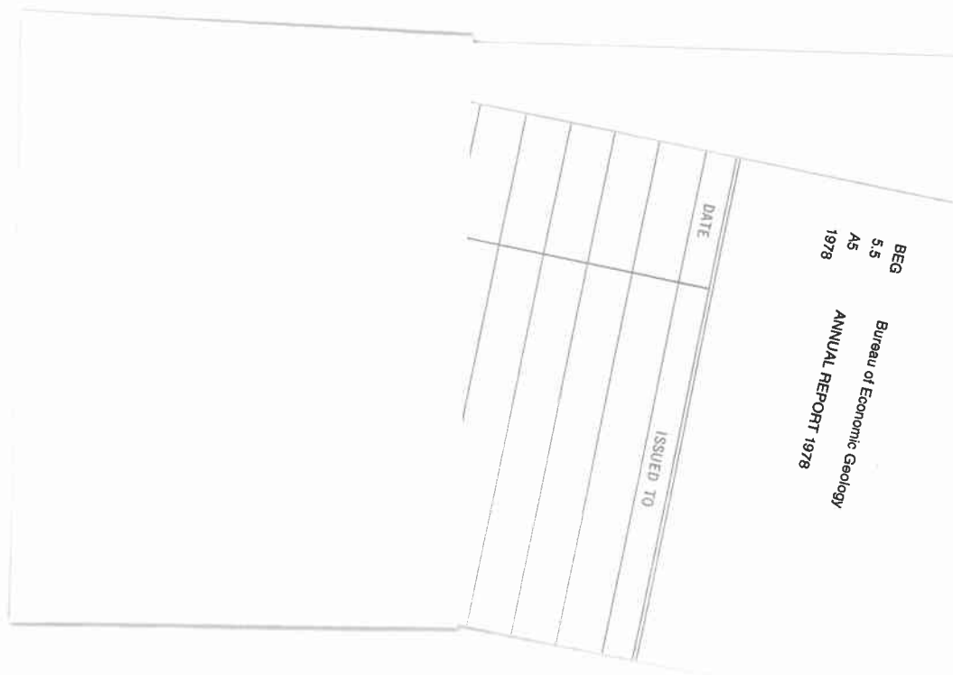
Cover sketch: Palo Duro Canyon

The Annual Report of the Bureau of Economic Geology outlines the scope and status of current research programs and projects, publications, professional personnel activities, and special services in the area of Texas geology and resources available to agencies, industry, and all citizens of Texas. The Annual Report is available on request.