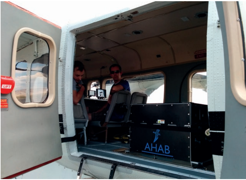
▲ Figure 2: AHAB Chiroptera installed in the aircraft.

testing procedures were completed (Figures 1 and 2). Test and calibration flights were completed in Grand Junction to ensure full system functionality before the production phase of the survey began in Alaska.