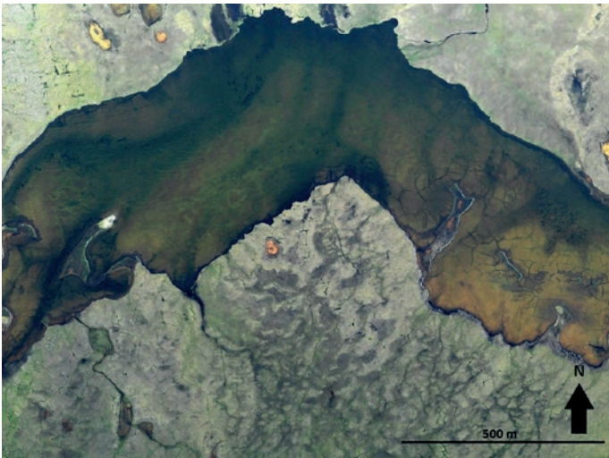
▲ Figure 3: A lake with clear and visible bottom.