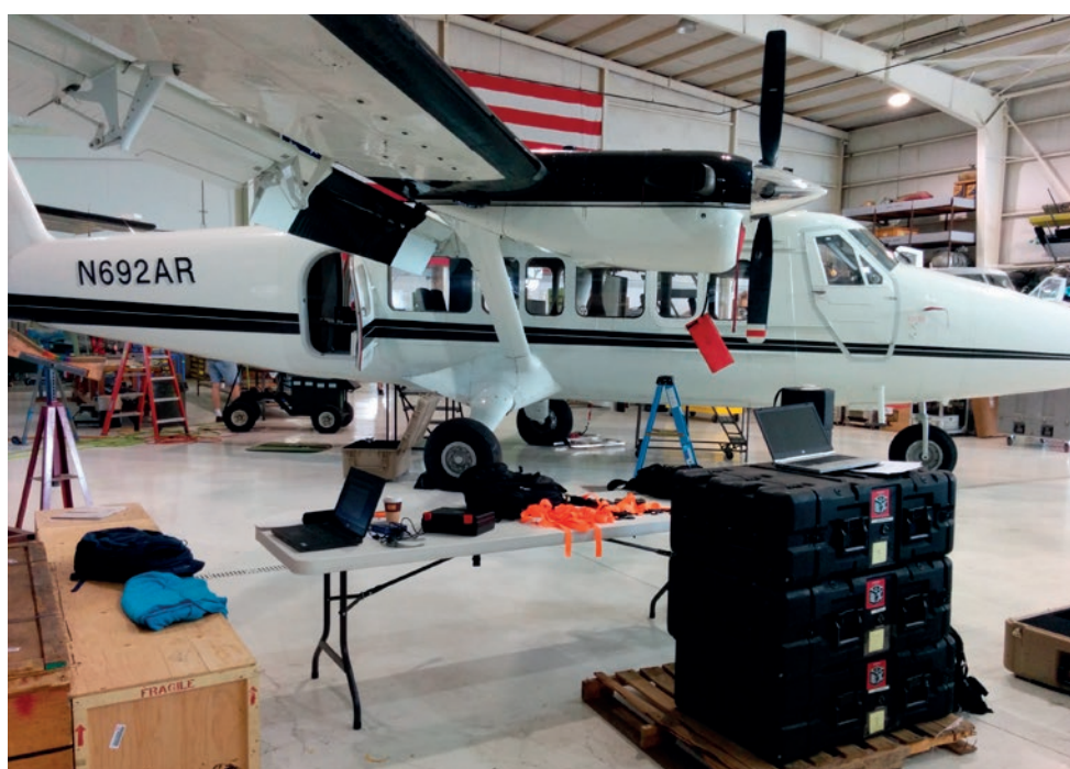
▲ Figure 1: De Havilland Twin Otter aircraft in Grand Junction, Colorado, for system installation.

A De Havilland Canada DHC-6 Twin Otter aircraft, along with two pilots and a mechanic, was assigned to the project. Researchers from the Bureau travelled from Austin, Texas, to Grand Junction, Colorado, where the aircraft was staged. Equipment was shipped to the base location at Grand Junction, where system installation and local