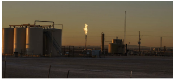
An oil field near Pecos; Texas only recently began its statewide program of monitoring for earthquakes.

suspended permits for deep disposal wells. . . . For local officials the earthquakes have presented new and unforeseen concerns about the structural integrity of buildings and buried pipes, as well as basic questions, such as, what are you supposed to do in an earthquake?"