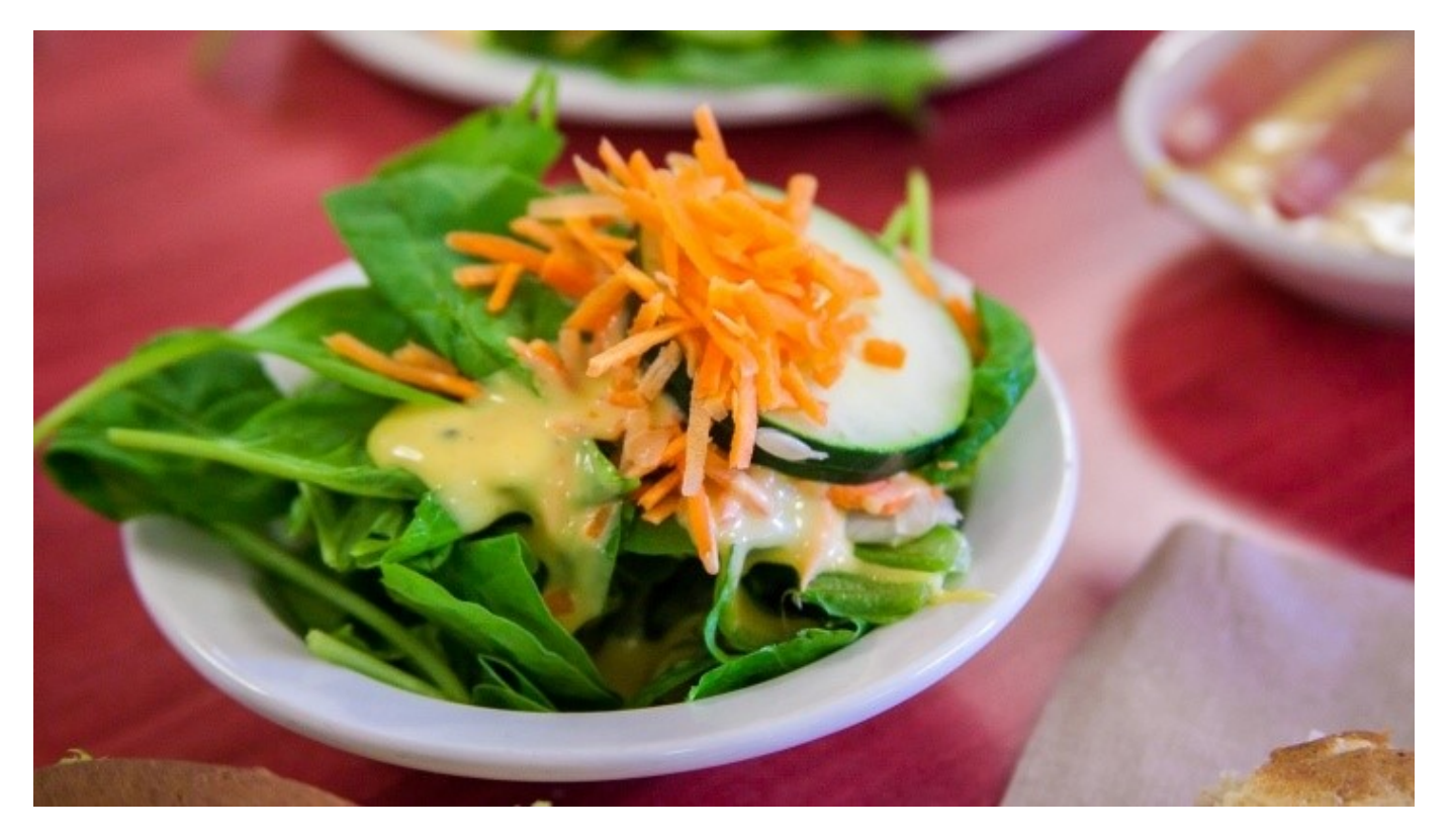
Trinity Establishes Virtual Food Pantry and Reusable Clothing Closet