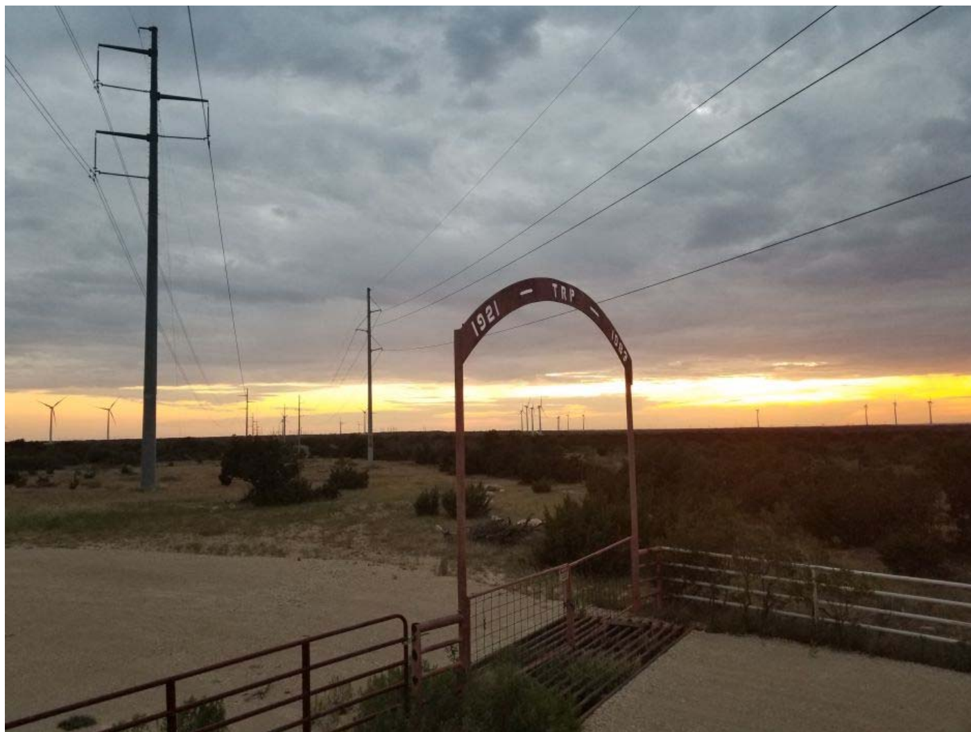
More than 300 wind turbines make up the Sweetwater Wind Project, outside Sweetwater, Texas. The county boasts one wind turbine for every 12 residents.