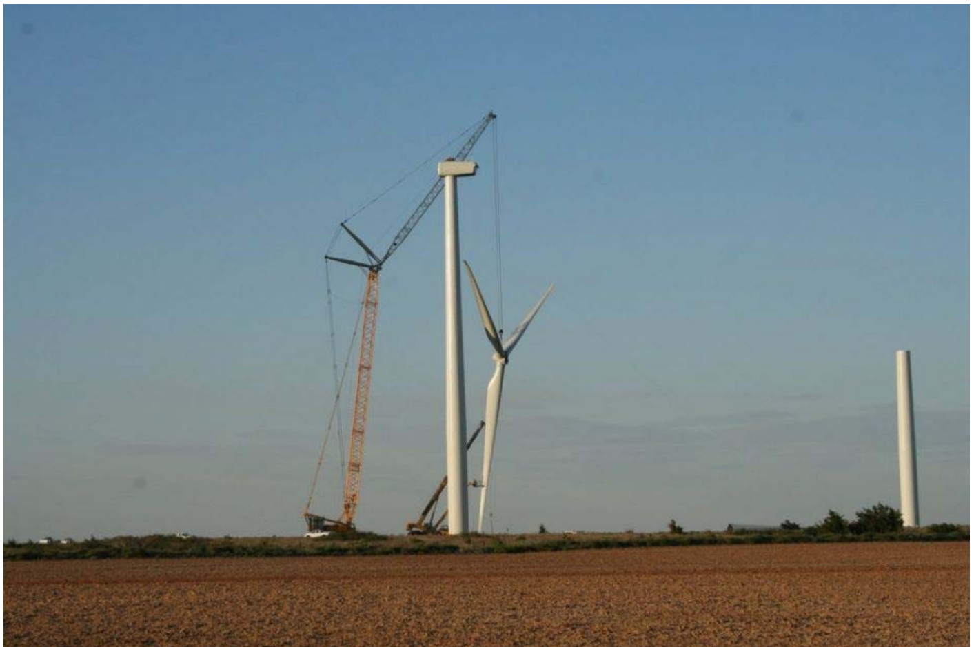
Today, the U.S. has more than 57,000 wind turbines nationwide, with a wind rush underway to build more before a federal subsidy expires in 2019. Here, a wind turbine is shown under construction.

The bill passed the Energy Resource Committee but died before making it to the House floor.