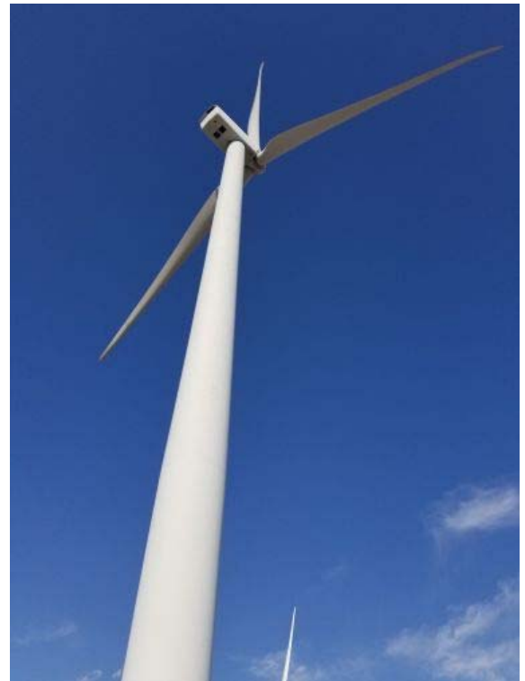
A 260-foot wind turbine stands outside Loraine, Texas. Newer wind turbines can be twice as tall, have a longer lifespan and be more efficient than older turbines. Kristian Hernández

Today, at least 38 states, including Texas, have renewable energy standards