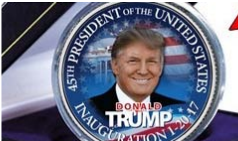
Donald Trump's New Controversial Coin Angers Liberals