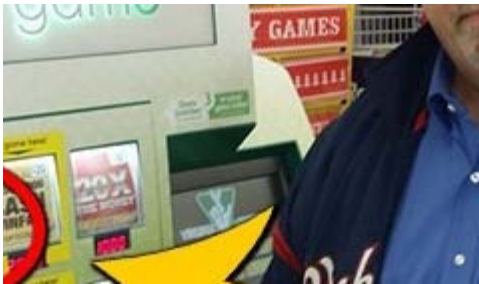
[14 Time Lotto Winner] 1 Easy Trick Before Buying Your Ticket (Do This Now!)