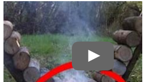
10 Survival Skills Your Great-Grandparents Knew (That Most Of Us Have