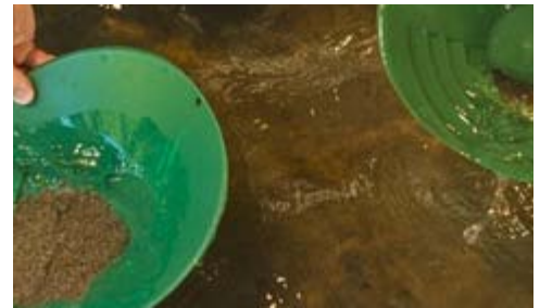
Donald Trump To Green-light Largest Ever Gold Mine?