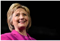
Houston Chronicle Clinton Endorsement for President (Vietnamese)