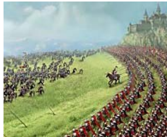
This game will keep you up all night! Stormfall: Free Online Game