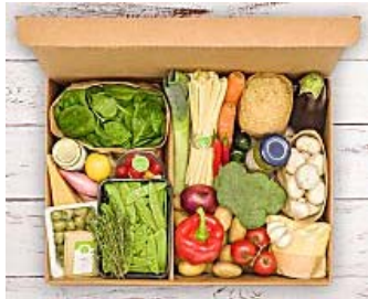
This Service in Austin is Changing the Way People Cook at Home HelloFresh