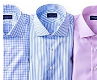
Why Guys in Texas Love This Shirt Company Proper Cloth