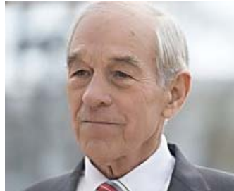
Former Congressman: Get Ready For Financial Martial Law