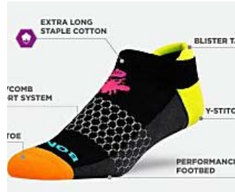
How This Sock is Changing the Industry Bombas Socks