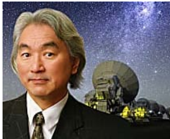
Do You Binge-Watch Documentaries? You'll Love This Website LA Times | Curiosity Stream