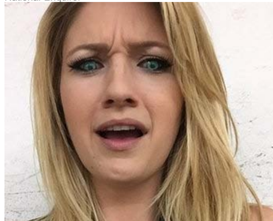
Ever look yourself up? This new site is addictive. If you enter your name on this site, the results will surprise you. Instant Checkmate