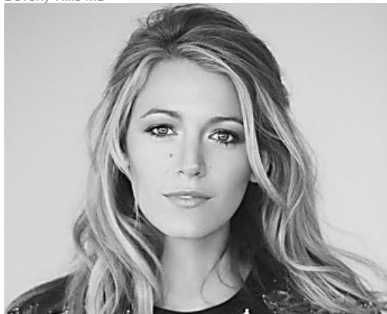
Her Real Name Will Make Your Jaw Drop! Your Daily Dish