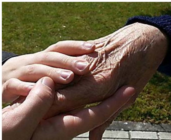
How To: Fix Crepey Skin [Watch] Beverly Hills MD