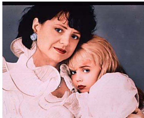
JonBenet Ramsey's Murderer Revealed National Enquirer