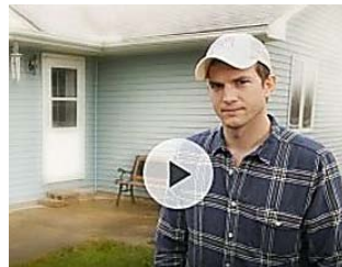
Ashton Kutcher's Surprise Mother's Day Gift