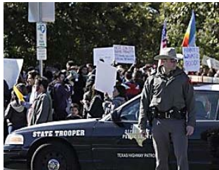
Federal Judge Nixes Texas Attempt To Block Syrian Refugees