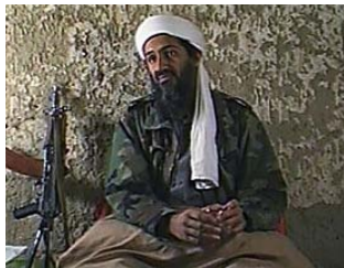
Navy SEAL Kept Secret Pic of bin Laden Corpse: Report