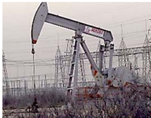
Study Says Some Texas Oil Producers Can Get By on $30 Oil