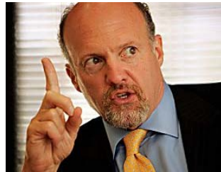
Jim Cramer is Alerting Investors of His Trades Before He Makes