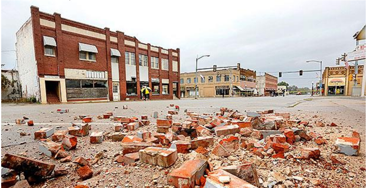
Damage in Cushing, Okla., which was struck with a magnitude 5 earthquake on Nov. 6 last year.

Federal officials say the risk from man-made earthquakes in Oklahoma and Texas has diminished as companies have slowed oil field wastewater disposal.