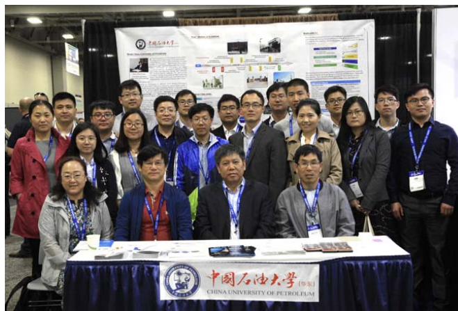
The delegation of UPC attended AAPG convention and set the UPC exhibition.