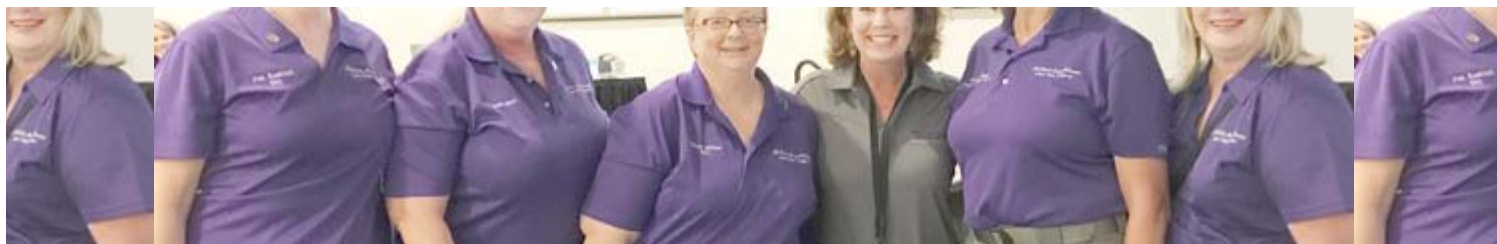
Well Armed Woman group practices skills