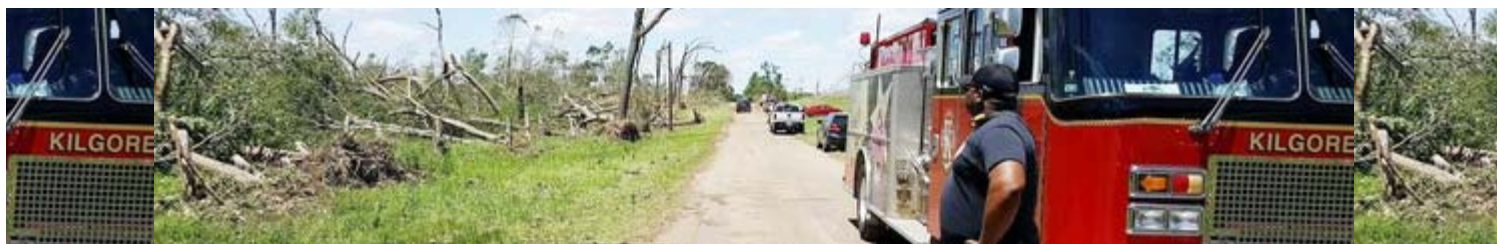
Emergency workers, residents help in tornado-ravaged areas