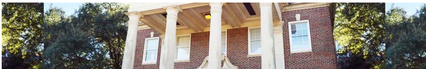
Local foundation continues fueling healthcare in city