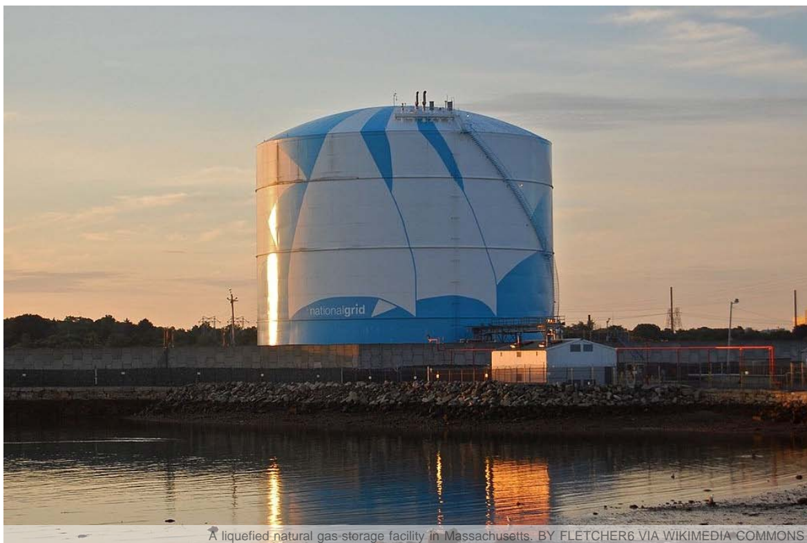
A liquefied natural gas storage facility in Massachusetts.

MOSE BUCHELE, KUT | JANUARY 24, 2017, 7:16 AM (LAST UPDATED: JANUARY 24, 2017, 8:12 AM)