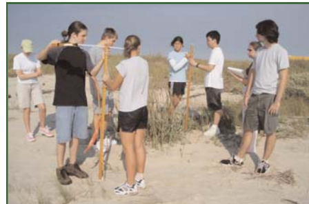
Ball High School students conduct a topographic profile.

For more information about the Texas High School Coastal Monitoring program, please visit www.coastal.beg.utexas.edu/thscmp .