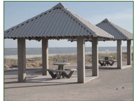
Some of the improvements to LCRA's Matagorda Bay Nature Park.

In conjunction with Matagorda County, LCRA also is providing amenities to other park visitors. It recently completed work on sites to accommodate 70 recreational vehicles and has used CMP funds to construct six picnic shelters, a kiosk that offers information on protecting coastal resources and a