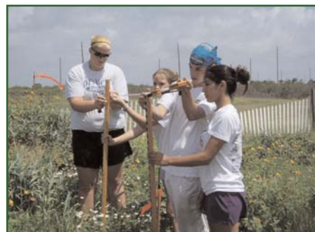
Ball High School students measure the horizontal distance between Emery rods at Galveston Island State Park.