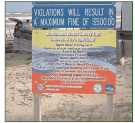
One of the new safety signs on Galveston Island.

The 2001 CIAP grant cycle ended in May. As part of this grant, Texas received more than $26 million that was divided among and overseen by the 18 coastal counties, the GLO and the Coastal Coordination Council.