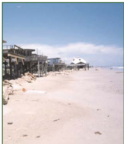
Houses on the beach at Surfside.

a coastal issues newsletter from your Texas General Land Office